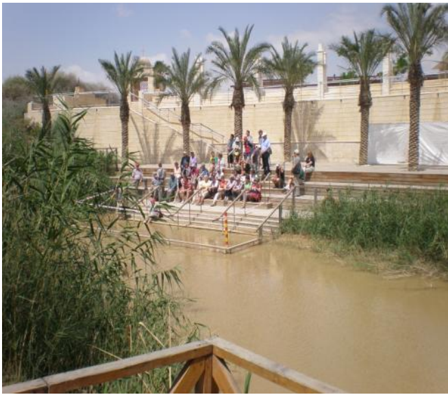
The Baptismal Site