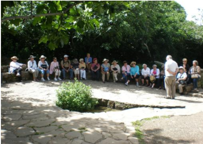
Our Group at Caesarea Philippi