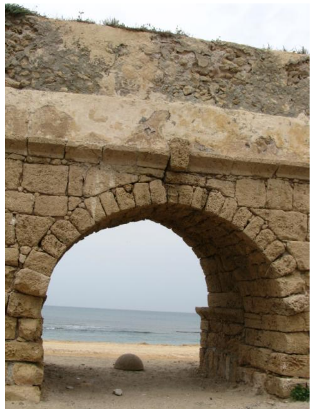
These were also taken at Caesarea