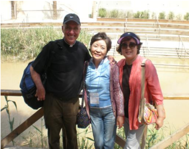
Our Korean Friends