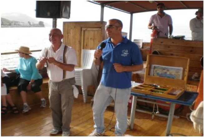
On the Jesus Boat